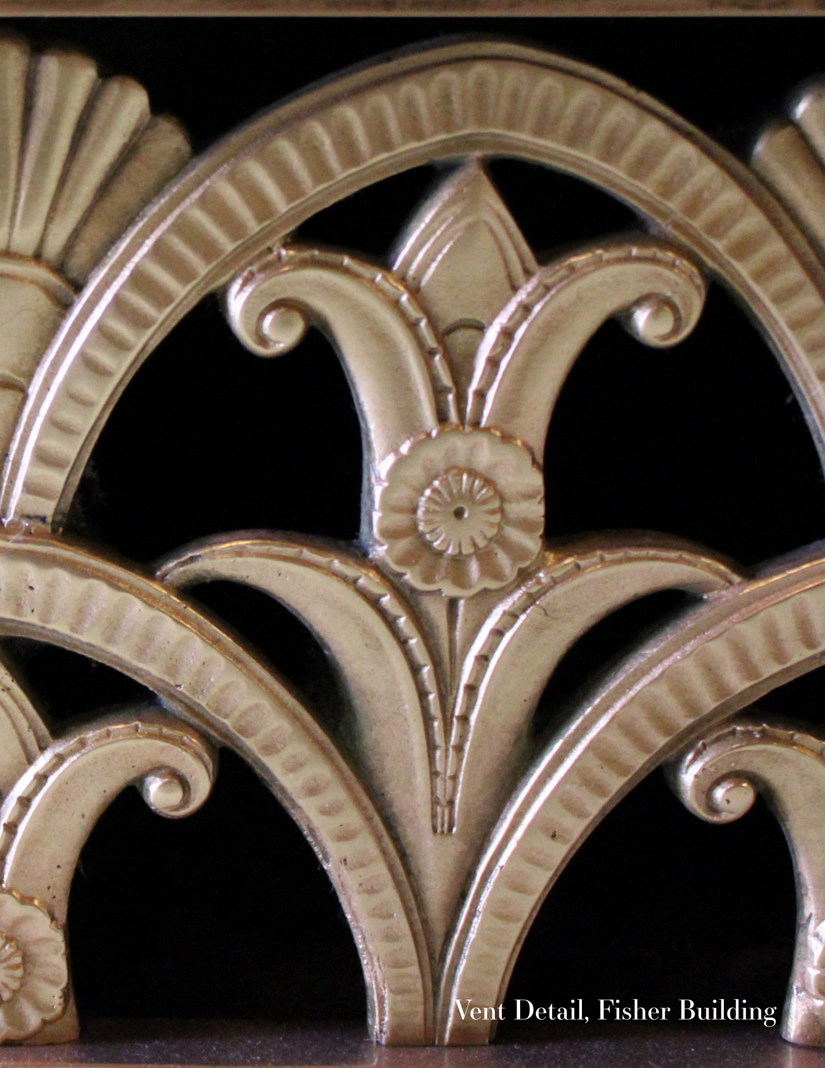
Vent Detail, Fisher Building